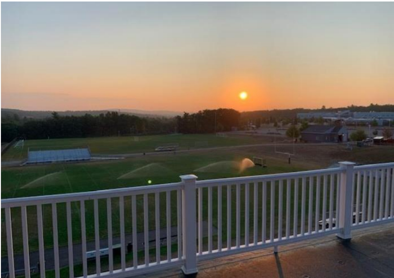
Press Box Photos -in house team working on installing sound system

Press Box - The press box is 90% complete at the high school. We are awaiting the window delivery. Thanks to all of the community support and time to help accomplish this.