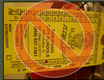
Out of Date

Code requires that extinguishers be serviced annually by trained technicians. The tag is designed to readily indicate when the extinguisher was last serviced by extinguisher technicians by use of a hole punch to indicate the year, month & day of service.