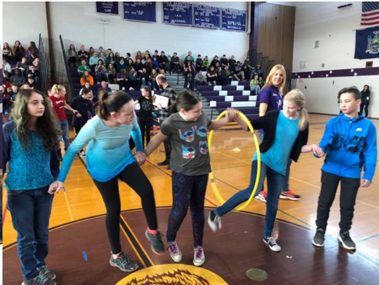
"Battle of the Grades"