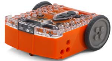
The Edison robots that 6th grade is using for their first unit in robotics.

Students have been learning the Engineering Design Process in anticipation for designing and creating their paper airplanes for our Flight Unit. Our next unit will be Boats in which students will use the Engineering Design Process as well as their knowledge of Forces to create a successful contraption. Students have been learning how to work together and communicate as an effective team.