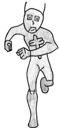
"DragonFly" superhero illustration by Wyatt V.